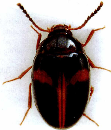
Fig. 1. Habitus of Microamarygmus tsugeae sp. nov., holotype, ♂.

Pronotum somewhat trapezoidal, twice as wide as long, widest at base; apex almost straight, though very slightly emarginate on each side; base gently produced in medial 2/5, weakly sinuous on each side; sides rather steeply declined to lateral margins, which are gently rounded, bordered and visible from above; front angles rounded, hind angles obtuse; disc broadly convex, moderately scattered with small punctures, which are almost of the same size as those on the head. Scutellum triangular, flattened,